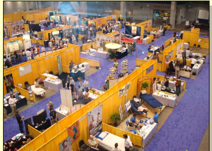
2007 AMTA National Convention Exhibit Hall.

Although the conference is fairly costly at $395 for early